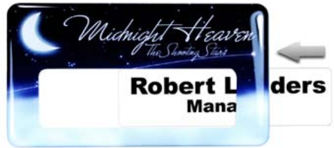
First Name and Last Name With Title