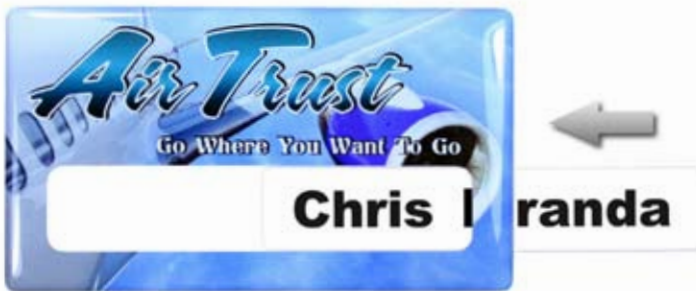
First Name and Last Name Only

Our reusable photo quality "domed" window name badges are available with a super strength magnetic attachment that will not damage clothing. Recommended window dimensions are 0.5" X 2.5" (WBI 50) for first and last name only and 0.75" X 2.5" (WBI 75) for first and last name with a title underneath. Printable blank nametag inserts are provided with your order and available to purchase for future use in both sizes. E-mailed template is provided free of charge for easy printing of the insert tags with both laser and inkjet printers.